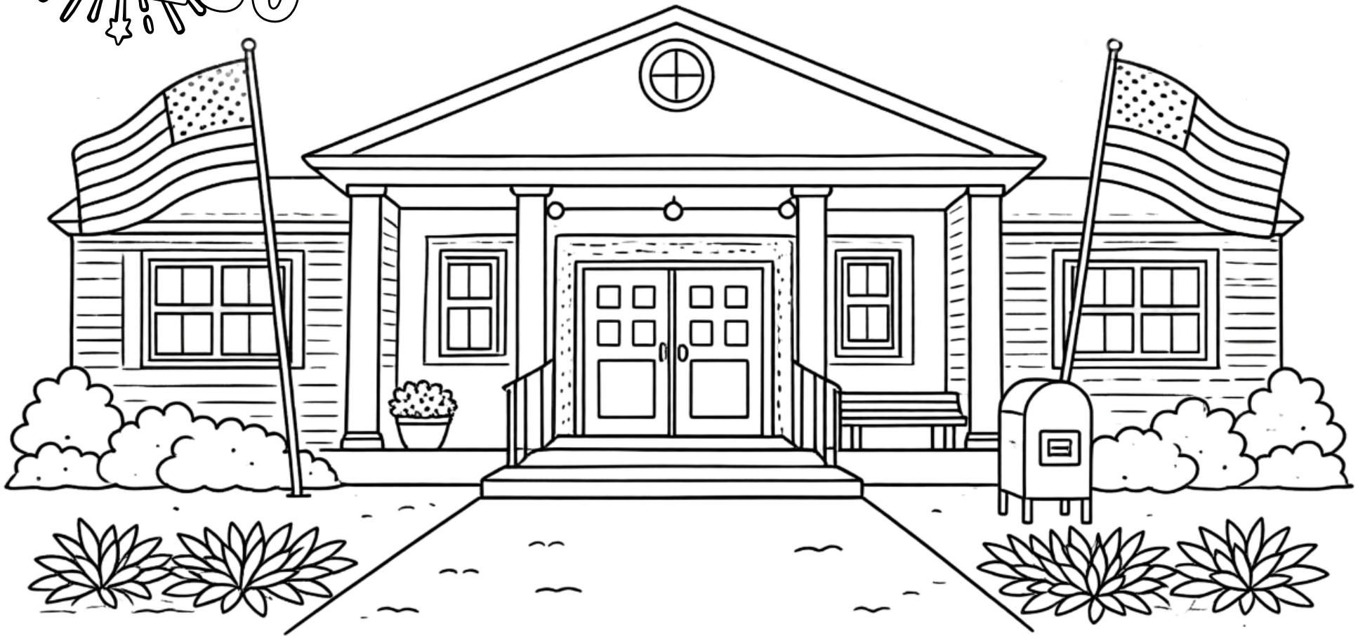
Town Hall, Salem, New Hampshire