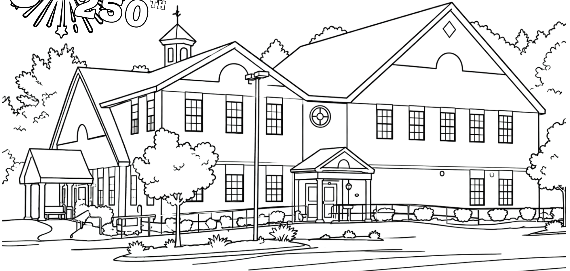
Ingram Senior Center, Salem, New Hampshire